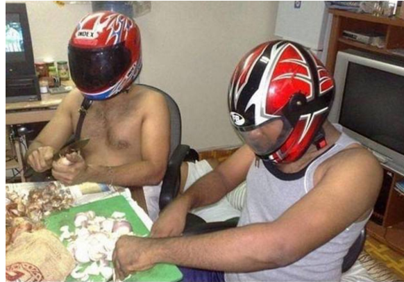
Peeling onions like a boss.