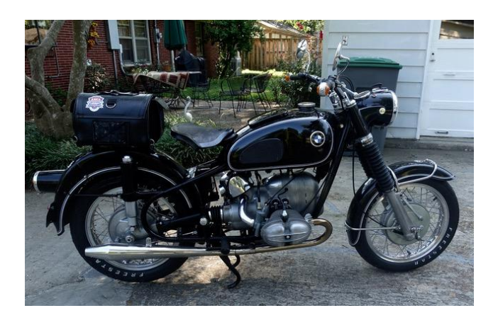
For Sale 1968 R69US BMW All Original, $12K

{\bf Contact\ Marshall\ Robilio\ 901\text{-}685\text{-}7367\ for\ more\ information\ or\ additional\ photos.}