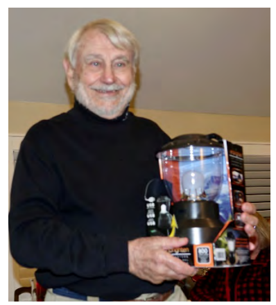
Marshall: "It's MINE!"