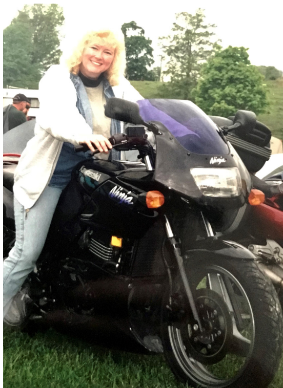
Old photo of me on the Ninja

Reminiscent of cold rides. One year in early November a group of friends rode from Johnstown Pa to Canaan Valley West Virginia for a weekend of falling leaves and twisty roads. We woke up Sunday morning with frost on the bikes and icy weather to battle home. I was riding a 500 ninja with little wind protection , and at the time I had not built my closet up to the correct riding gear. My friends were cold on their bigger bikes with windshields, fairings, and heated gear. I was frozen stiff sitting up high on my Ninja. I could not feel my fingers and was sure my toes were frostbitten. We often stopped to warm up, yet I had a few moments where I did not think I would make it. When we started the climb up the last mountain to Johnstown, we were riding on the berm to gain traction and avoid the frozen slush on the road. Winter came early that year to stall our fall riding. To this end, I say we are a rare breed as I would hop on the bike again and take the ride. Now I would be one of the warmer riders with all my accumulative gear and, of course, a bigger bike with a windshield.