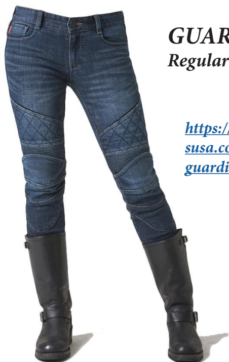
GUARDIAN-G Regular price $299.00

https://www.uglybro-susa.com/products/guardian-g