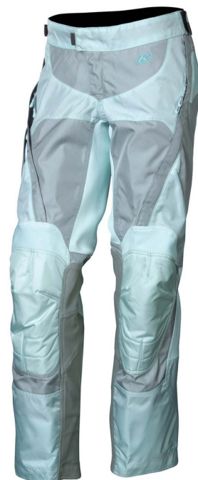
KLIM SAVANNA PANT $129.99 to $149.99

https://www.klim.com/Savanna-Pant-000?quantity=1&color=13