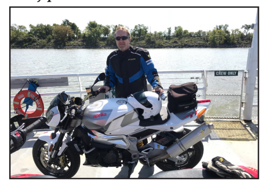
Photo taken on a ferry during our Saturday ride at the BMW RAMS rally.

* Dont forget your name... I may not have you in my phone..