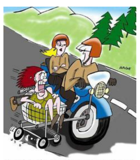
"First of all, you're the one that wanted me to include your mother more and secondly, you gotta admire my ingenuity."