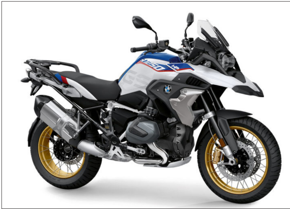
The R1250GS HP style variant includes a white rallye color scheme, golden spoked wheels, flat seat and short windscreen.

At the heart of the new GS is a grunter 1,254cc engine (previously 1,170cc) putting out 136 hp and 105 ft-lb of torque. The engine also uses Shiftcam Technology which enables variation of the valve timings and valve stroke on the intake side. The intake camshafts are further designed for asynchronous opening of the two intake valves, resulting in a swirl of the incoming mixture that provides more effective combustion. The engine also features an optimized oil supply, twin-jet injection valves and a new exhaust system.